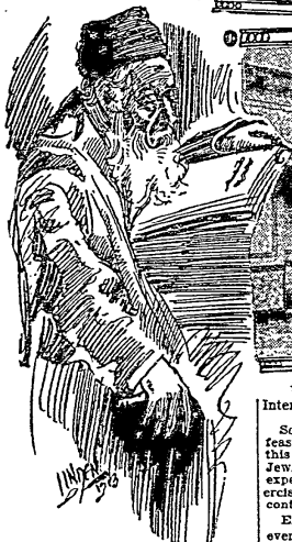
SIR MOSES MONTEFIORE.