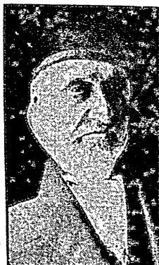
Noted Jewish Philanthropist and Teacher, born Oct. 26, 1784; died July 28, 1885.