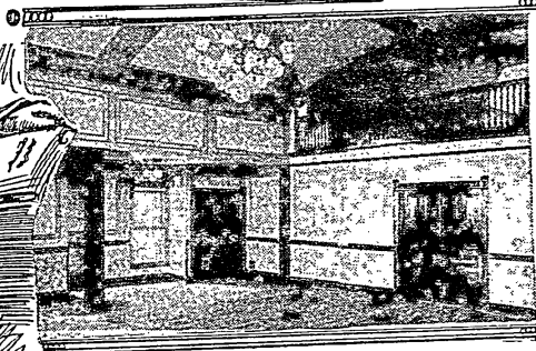
Upper picture—Exterior view of the school building. Lower picture—Interior view showing the extensive improvements made.

Solemn religious exercises and feasting will mark the dedication of this educational and social center. Jews within a radius of 100 miles are expected to attend the opening exercises, which will start at 2 p. m. and continue until midnight.